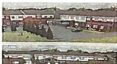
BEAVERHILL PIONEER LODGE Lamont, Alberta

A Management Body approved by Ministerial Order to be responsible for the operation of affordable housing for Seniors and Adults with special needs in Lamont County and Municipalities within Lamont County