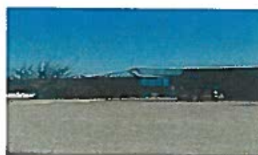
ANDREW SENIORS LODGE Andrew, Alberta