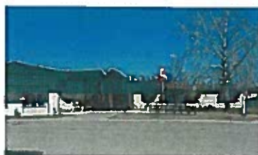
FATHER FILAS MANOR Mundare, Alberta