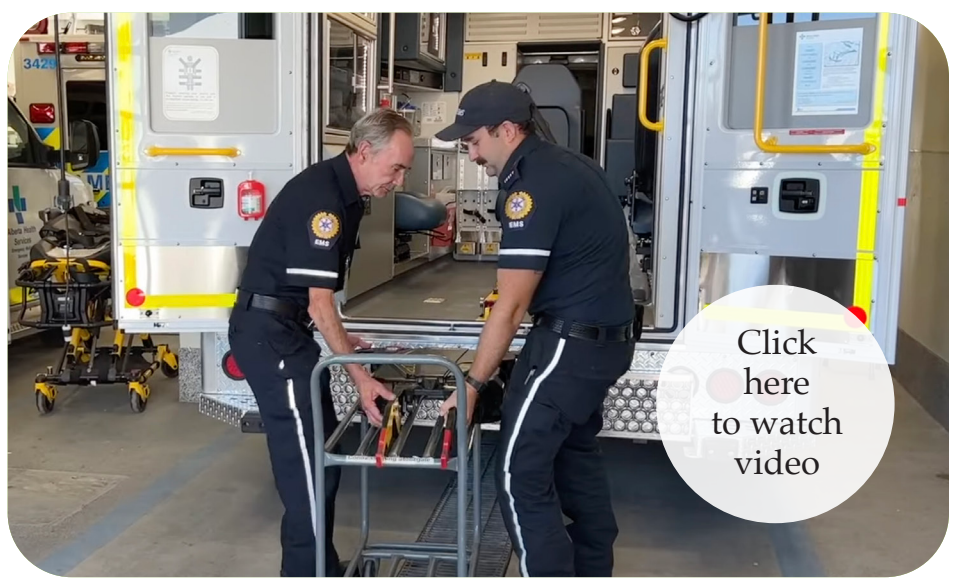
EMS technicians work to install power lifts in one of 10 additional new ambulances.

From March 2020 to June 2022, the number of Albertans waiting for a CT scan dropped by almost 24 per cent, and for MRI scans by 13 per cent, despite a sharp increase in demand.