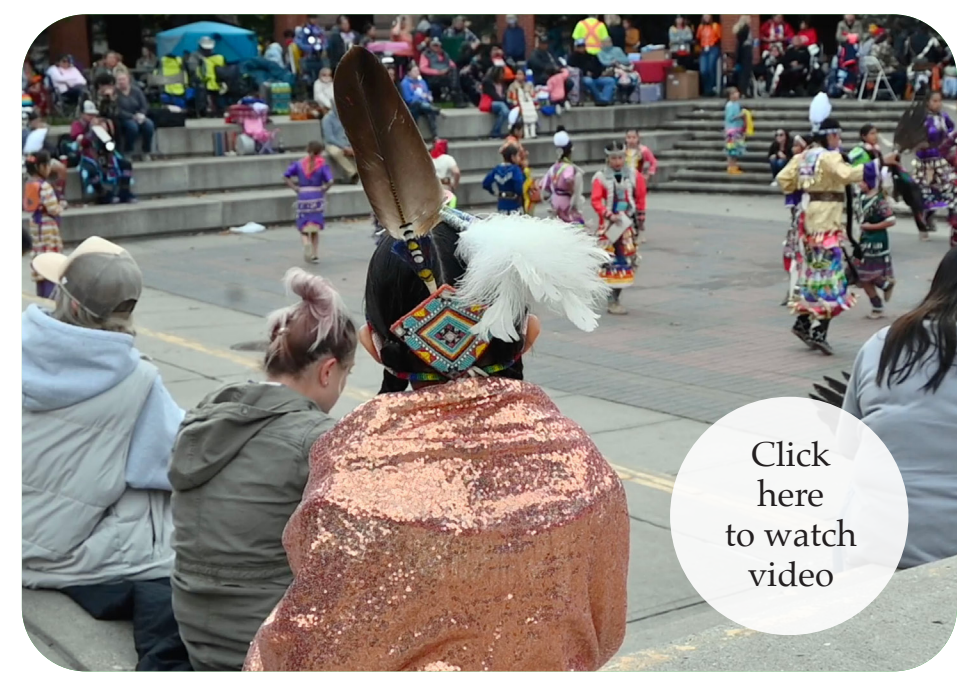
A powwow was held as part of a 'pop-up clinic' at a downtown Lethbridge park last month. The clinic brought a wide range of health services together for one day, improving access to healthcare for the city's underserved downtown Indigenous population.

Pop-up clinics have been developed based on the findings of Innovative Models Promoting Access to Care Transformation (IMPACT), a research study that explored how to deliver care to people who otherwise have limited or no access to traditional healthcare.